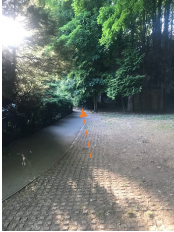
Start of the walk from Whirlow Bridge

3. Follow the path through the woods with the brook on your left (my children love climbing the steep banks on the other side), after about half a mile there are some very steep steps up the valley to your right - go up these and follow the narrow track to the left almost at the top (take care!)