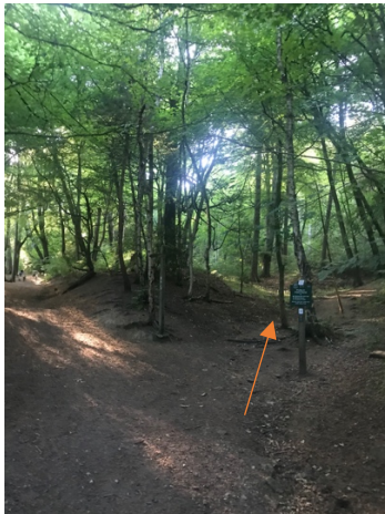
Steps up the valley

3. Follow the path through the woods with the brook on your left (my children love climbing the steep banks on the other side), after about half a mile there are some very steep steps up the valley to your right - go up these and follow the narrow track to the left almost at the top (take care!)