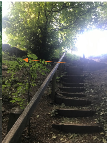
Track to the left to the swing

4. Following this narrow path you will reach an area with a rope hanging down – this is not the swing! Bear to the right at this broken swing and follow the track which now follows the boundary wall fairly closely. After some bumps for the children to run up and down you will come to a swing that takes you out and over the valley - not for the fainthearted. Where the swing is also has a nice view out over Ringinglow